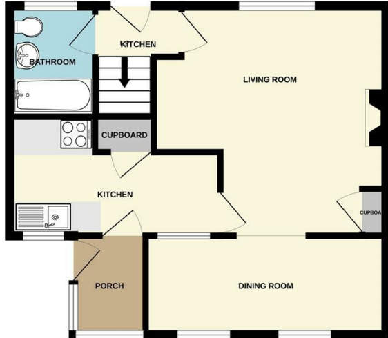
GROUND FLOOR 457 sq.ft. (42.5 sq.m.) approx.